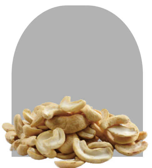
LP Cashew Nut