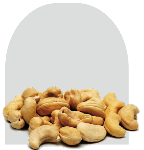
W240 Cashew Nut (Super)