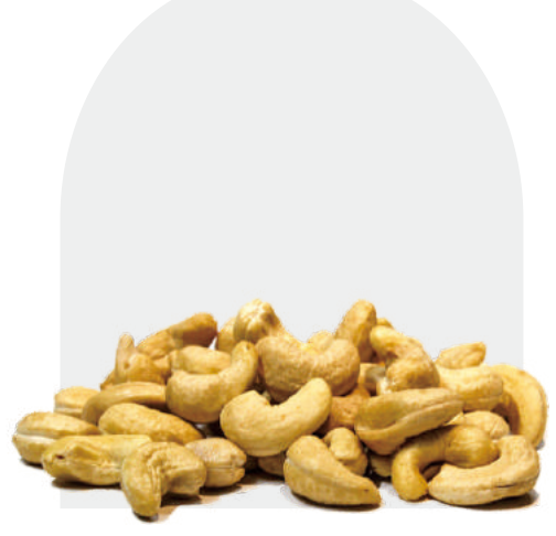
W320 Cashew Nut