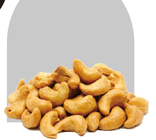
Roasted Cashew Nut